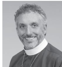
Bishop Stewart E. Ruch III Diocese of the Upper Midwest midwestanglican.org

We are also a member of the Anglican Church in North America (ACNA), composed of over 1,000 congregations across Canada, Mexico, and the United States.